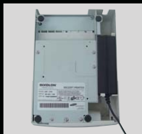
Built-in Power Supply

The 220V AD adapter is elegantly integrated into the compact printer housing. Consequently, messing around with cables is avoided which is ideal at space-limited POS terminals or highly frequented cash desks.