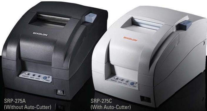
SRP-275A (Without Auto-Cutter)

The BIXOLON SRP-275 is an enhanced, more powerful successor to BIXOLON's best-selling SRP-270 Series of receipt printers. The BIXOLON SRP-275 receipt printer is compact, reliable and fast, and offers all of the easy-to-use features important to retail, restaurant, and hospitality environments.