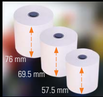
Variable Paper Width