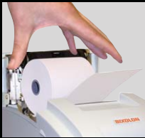
Easy Paper Loading

For maximum efficiency, the SRP-275 offers drop-in paper loading and the users can easily change the paper with one-hand. At the same time paper width guide allows you to use 57.5 ± 0.5mm, 69.5 ± 0.5mm, or 76 ± 0.5mm paper rolls for more flexibility and greater cost savings.